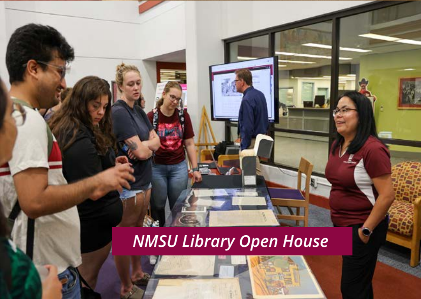
NMSU Library Open House