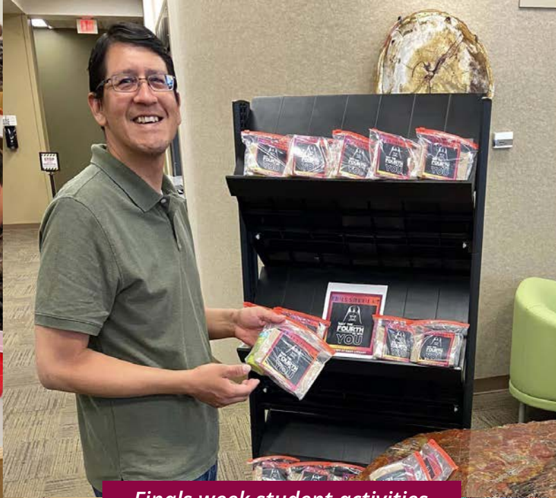
Finals week student activities